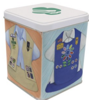
Girl Scout Vintage Uniform Tin with Mint Treasures