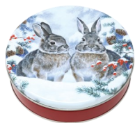
Bunny Tin with Chocolate Covered Pretzels